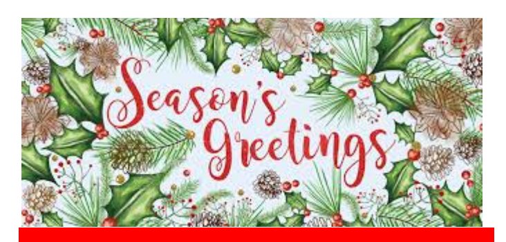
The staff of Blaxland Public School wish everyone a happy and safe holiday with those they love and look forward to a wonderful year in learning in 2020.